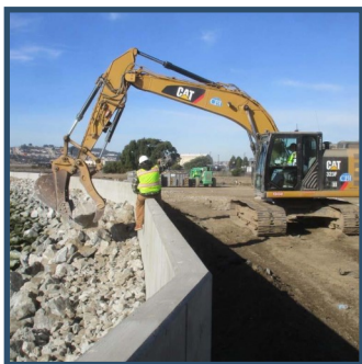
Placement of armor stone