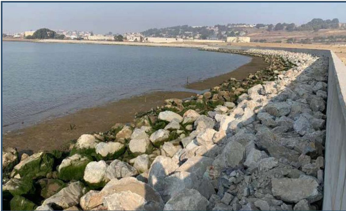
View of final revetment and sea wall at Parcel E-2 (looking northwest)

An important element of the Navy's cleanup solution at HPNS is rebuilding the shoreline to protect against future sea level rise and prevent contamination from entering the San Francisco Bay. The solution involves two components at Parcel E-2: (1) constructing a protective rock barrier (known as a "revetment") on the shoreline to stop erosion from the site and (2) building a 3-foot-high cement sea wall to prevent Bay waters from washing up over the rock barrier. The team has worked diligently on various aspects of this project all year and is very happy to report that the shoreline protection is complete!