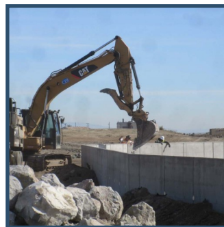
Installation of filter rock