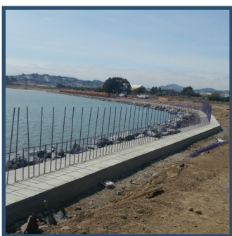
Positioning of rebar for form

In addition to shoreline protection, the revetment and sea wall will protect an important part of the Bay Trail, providing outdoor enthusiasts a link to a 500-mile walking and cycling path planned around the entire San Francisco Bay.