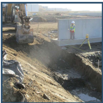
Trench excavation for headwall