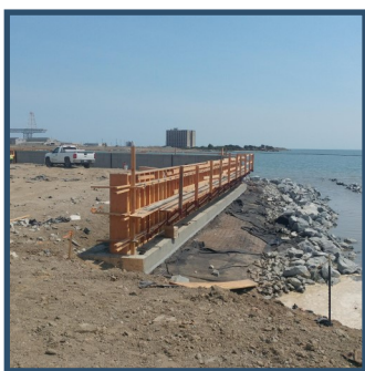
Building of sea wall form